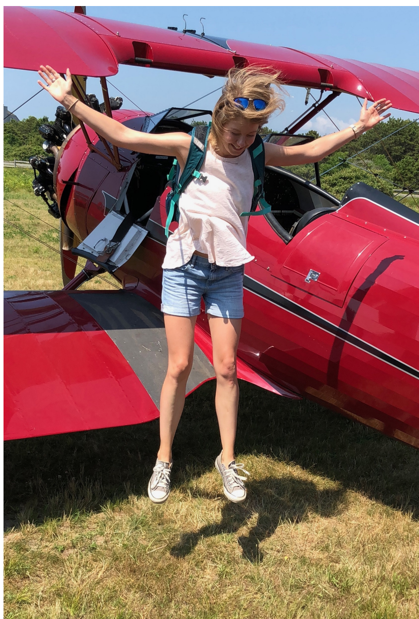
Fig 2 | Representative study participant jumping from aircraft with an empty backpack. This individual did not incur death or major injury upon impact with the ground

The PARACHUTE trial satirically highlights some of the limitations of randomized controlled trials. Nevertheless, we believe that such trials remain the gold standard for the evaluation of most new treatments. The PARACHUTE trial does suggest, however, that their accurate interpretation requires more than a cursory reading of the abstract. Rather, interpretation requires a complete and critical appraisal of the study. In addition, our study highlights that studies evaluating devices that are already entrenched in clinical practice face the particularly difficult task of ensuring that